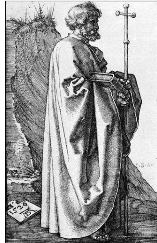
A portrait of Saint Philip, one of the twelve apostles, holding a cross. Philip's martyrdom was on a cross. Saint James was put to death by beheading at the order of King Herod. They died for the faith they confessed.