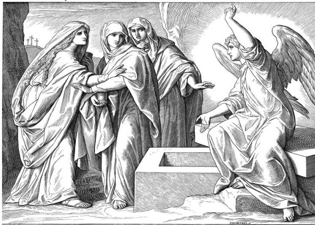
Die Frauen am Grabe Jesu.

Das sie gingen hinein in das Grab, und sahen einen Jüngling zur rechten Hand sitzen, der hatte ein lang weiß Kleid an, und sie entsetzten sich, (Er aber sprach zu ihnen: entsetzt euch nicht. Ihr sucht Jesum von Nazareth, den übertraget; er ist auferstanden, und ist nicht hier. Geht hin die Gräber, da sie ihn bestatten. Mt. 28, Cap. 16, v. 5, 6.