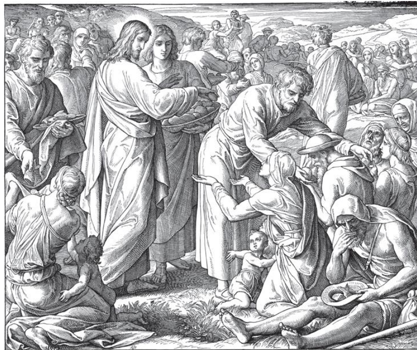
Wunderbare Speisung des Volks. Jesus aber sprach: schaffet, daß sich das Volk lagere. Es war aber viel Gras an dem Ort. Da lagerten sich bei fünf tausend Mann. Jesus aber nahm die Brod, dankete, und gab sie den Jüngern, die Jünger aber denen, die sich gelagert hatten; derselbigen gleichen auch von den Fischen, wie viel er wollte. Mt. Johannis. Kap. 6. v. 10. 11.

Immanuel Lutheran Church, Rockwell City Service at 8:45 a.m.