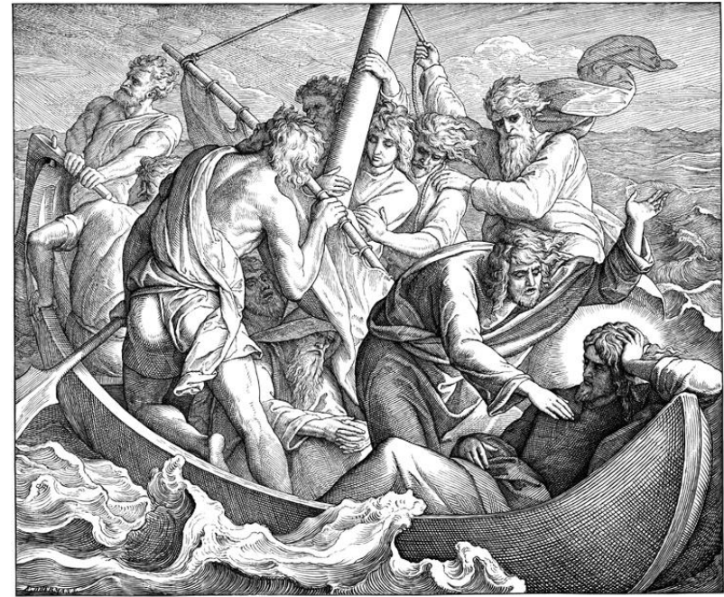
Jesus schläft während des Sturmes.

Und siehe, da erhob sich ein groß Ungeheuer im Meer, also daß auch das Schiffein mit Wellen bedeckt ward, und er schlief. Und die Jünger traten zu ihm, und wecten ihn auf, und sprachen: HER, hilf uns, wir verderben. Ev. Matth. Cap. 8. v. 24. 25.